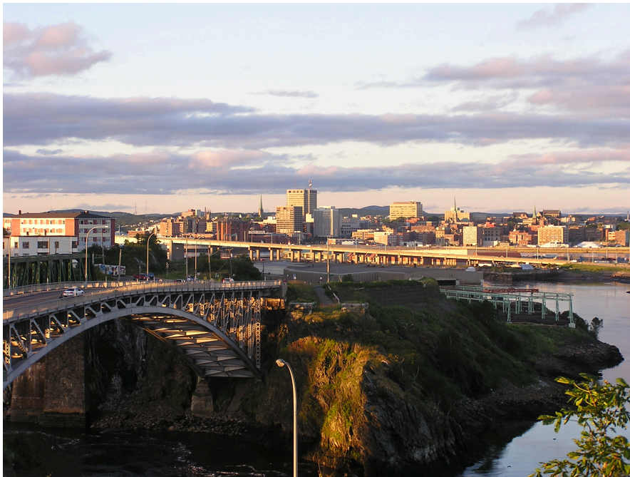
Saint John, New Brunswick

The conference is an annual event, always in a different location. It brings together foster & adoptive parents, caregivers, respite workers and social workers from all over Canada for workshops, training and networking.